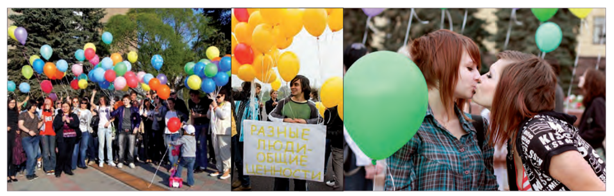
Rainbow flashmob in Russia